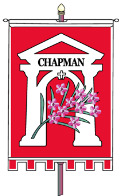
Champion House - Chapman