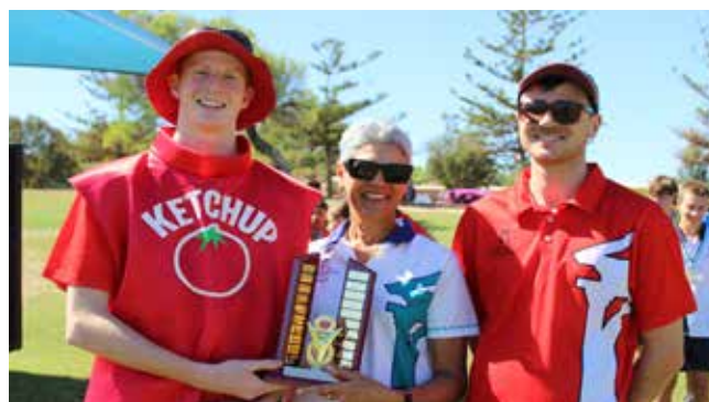
Primary Champion House - Murchison Secondary Champion House - Chapman